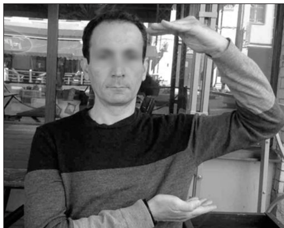
Figure 1: The co-speech gesture LARGE.