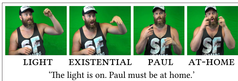
Figure 1: An example of epistemic modality.

A case in point to illustrate the difference between CP and TP/IP categories is the difference between epistemic modality (a CP category) and deontic modality (a TP/IP category). While DGS exhibits manual modal verbs like MUST or CAN , these are banned in epistemic contexts, as illustrated in (8). Instead, epistemic modality is expressed by squinted eyebrows in combination with tilting the head sideways and sometimes (repeated) head nods and closed eyes (Happ & Vorköper 2014; Herrmann 2013; Bross & Hole 2017; Bross 2020). See also Figure 1.