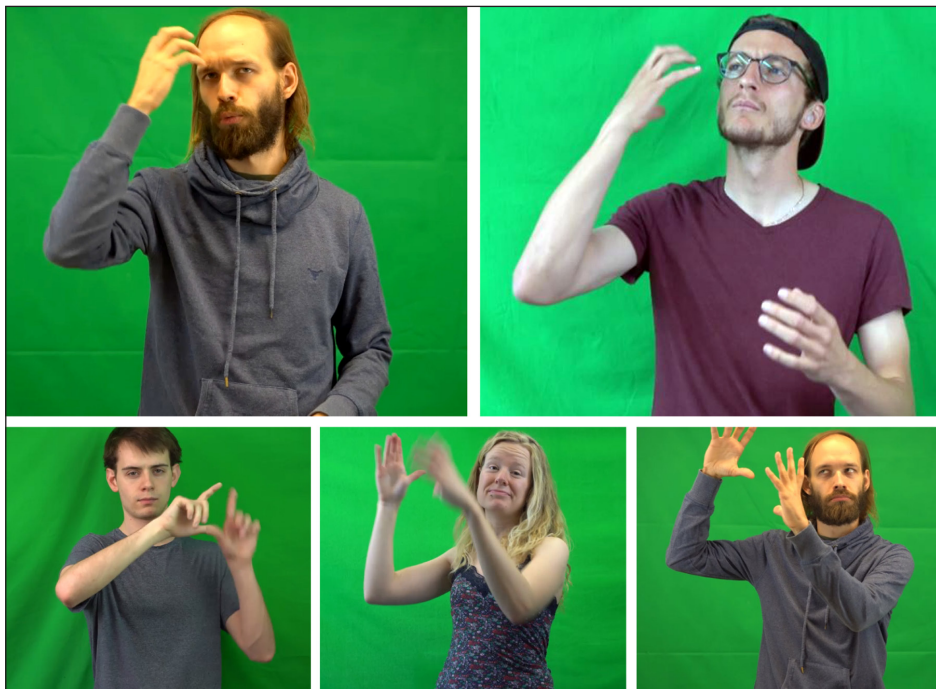
Figure 5: The two images at the top of the figure illustrate the non-manuals used for epistemic frames consist of squinted brows. The three images on the bottom of the figure show variants of the sign FRAME used with epistemic frames.