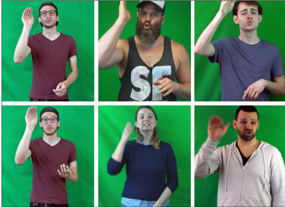
Figure 4: The non-manuals used for temporal frames. Top row: furrowed brows; bottom row: raised brows. Again, lower-face non-manuals are related to mouthings.

Similar to temporal and locative frames, epistemic frames occur in a clause initial position. Epistemic frames are, again, accompanied by a squint. Sometimes dense eyes are used, often eye gaze is directed upwards. Examples of the non-manuals used with epistemic frames are given in Figure 5 (top). The non-manuals spread only over the topic constituent or, alternatively, over the whole clause (probably to mark the whole proposition as being