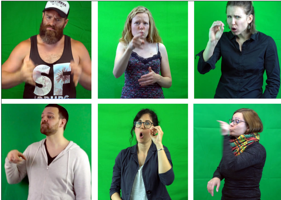
Figure 7: The non-manuals used for contrastive focus. Top row: Bavarian signers; bottom row: Baden-Württemberg signers. Figure partly adapted from Bross (2020).

(35) Context: Paul bought beer yesterday.