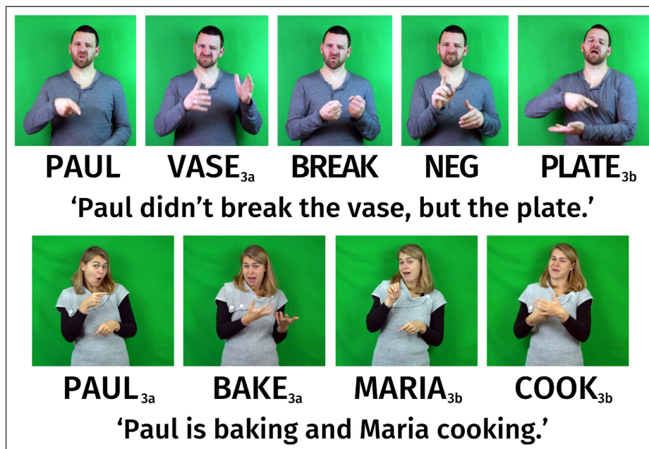
Figure 8: Two examples of the use of signing space in contrasts in DGS; upper part from Bross (2020).