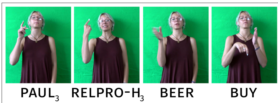
Figure 11: A depiction of the cleft sentence in (41).