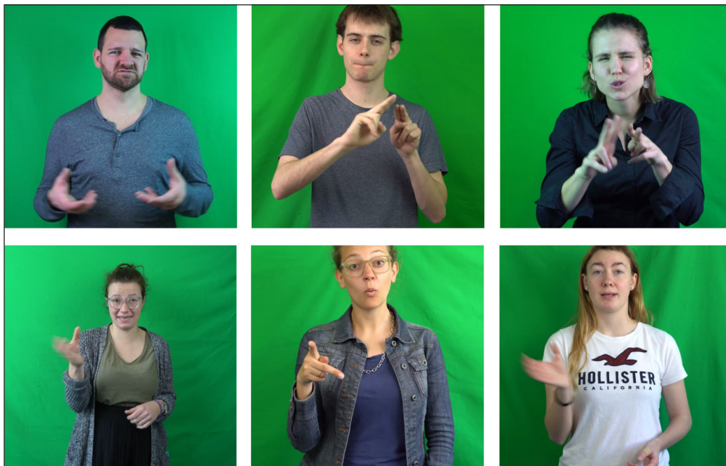
Figure 2: The non-manuals used for topics. Top row: base-generated; bottom row: moved topics. Note that the lower-face non-manuals are related to mouthings related to the lexical items.

In line with the idea that there are two distinct positions for topics in the left periphery, it is not possible to freely combine base-generated and moved topics in one clause. Typically, it is argued that a structurally higher position for base-generated frame-setting topics and a lower position for moved aboutness topics exists in the CP domain (e.g.,