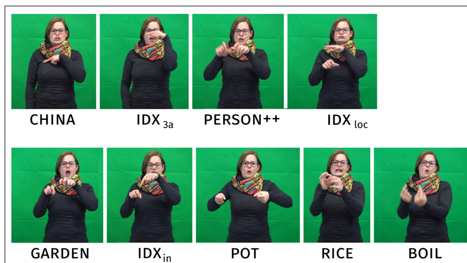
Figure 6: Different locative expressions receive different indices. The utterance produced is a version of the example in (29).

subject. Thus, the order GARDEN\ IDX_{loc} as well as the order IDX_{loc}\ GARDEN is attested in my data. Additionally, the subject may also precede the canonical locative (cf. Figure 6).