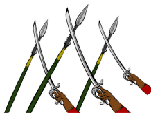
Figure 4: collective (Figure 2 in Arsenijević et al. 2020b, Figure 1).